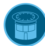
Short-Radius Micro Spray Nozzles Page 69

For a more robust overhead micro spray system, pair Short-Radius Micro Spray Nozzles with Pro-Spray sprinklers: