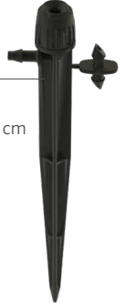
HS-B-STK Height: 15.2 cm